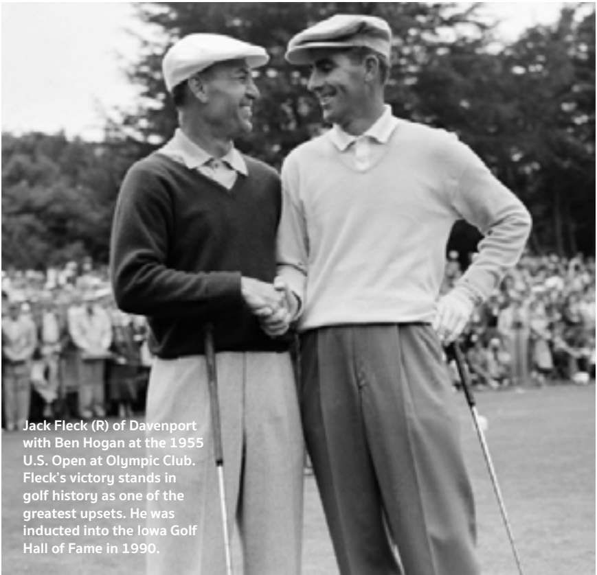
Jack Fleck (R) of Davenport with Ben Hogan at the 1955 U.S. Open at Olympic Club. Fleck's victory stands in golf history as one of the greatest upsets. He was inducted into the Iowa Golf Hall of Fame in 1990.